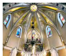
1728 Seneca St Buffalo (716)597-6683