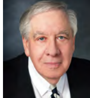
155 Summer St Buffalo (716)882-3333