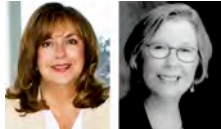
Moretti Consulting: (716)390-2277 My Executive Coach: (716)868-0398