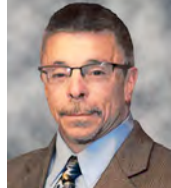
3517 Genesee St Cheektowaga (716)634-6111