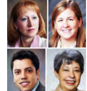
Buffalo & Amherst (716)881-3010